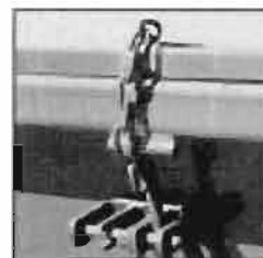
Front load: Lid Hold Down Latches for Quick Driver Release When Dumping