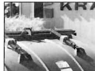
Loading Chamber Lid, Spring Assisted for Ease of Opening