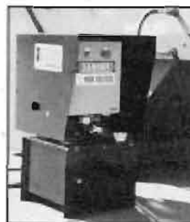
Compact Weather Proof 3 Phase and/or Single Phase Power Unit. (UL) Approved