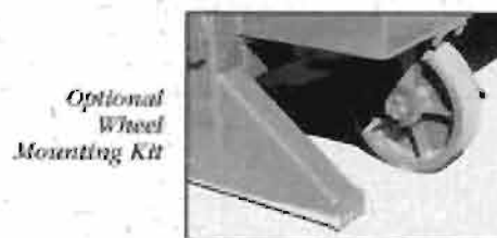
Optional Wheel Mounting Kit